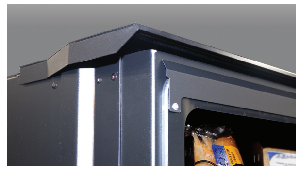
Impact resistance Lexan window cover, rain guards and anti-pry covers