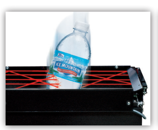
iVend® Guaranteed Delivery System

Keeps customers satisfied and reduces service calls for misloaded product.