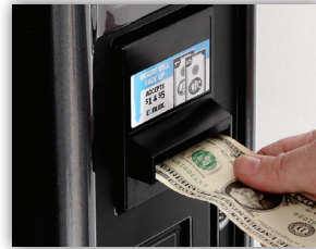
Premium Currency Acceptors Includes standard electronic coin acceptor and $1, $5, $10 & $20 bill acceptor. (Set for $1 & $5).

10.1 inch full-color capacitive touch screen provides customers with a shopping cart purchase experience including product calorie information