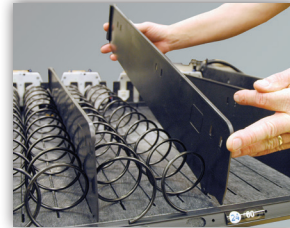
Re-configure trays to almost any package size in the field with no need for tools.